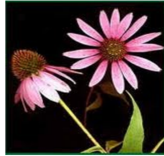
Echinacea ( Echinacea angustifolia )

We stock a fabulous organic Echinacea tincture (the most potent way to take herbs) in three sizes. Why not keep some in your medicine cabinet to quickly banish any unwanted virus that comes your way this winter?