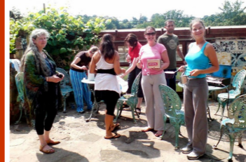
Students enjoying the practical side of herbs in Shropshire this June!

Learn simple remedies to keep you and your family well this winter... and take a few home with you too!