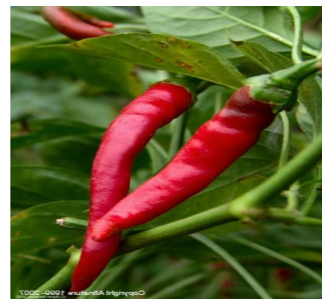
Cayenne 'chillies' ( Capsicum annum )

Why not make individual garlic and ginger pastes too?