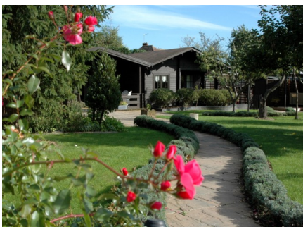
Summer house.

Venue: Primrose Cottage, High Wych, Essex